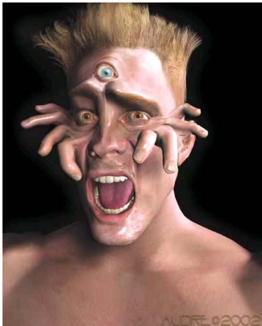
Bad Hair Day The artist explores her fascination for the macabre in this non-fractal-based image, illustrating her range of styles.