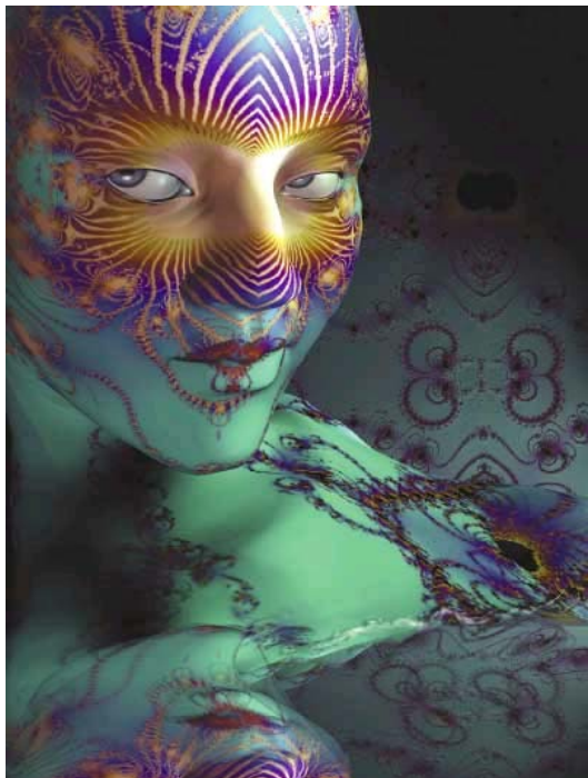
Dreamcatcher This image serves as another example of the artist's unique application of fractals as image textures.