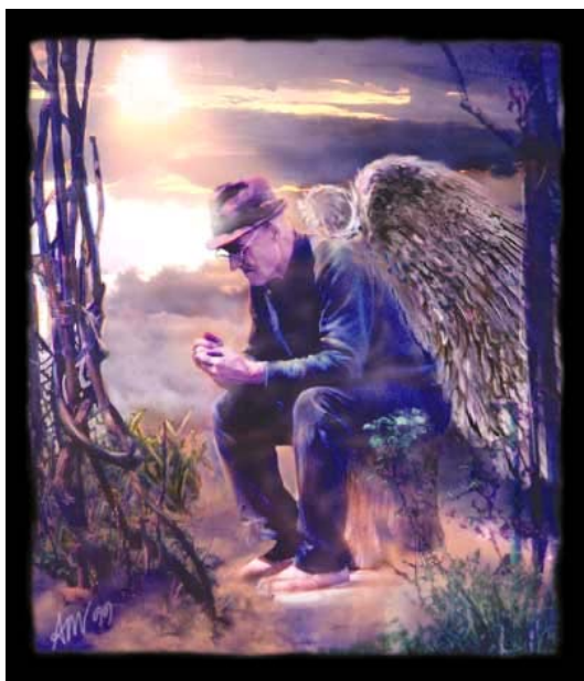
Grempy's Wings While this image doesn't contain fractals, it is illustrative of a photo-manipulation technique the artist accomplished using Photoshop and a Wacom graphics tablet.