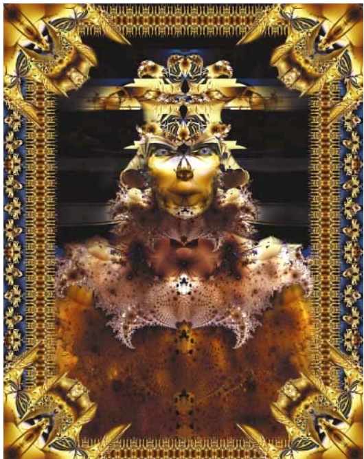
Sophisticati Composed in Photoshop, this selection is almost entirely composed of fractals created in Ultra Fractal.