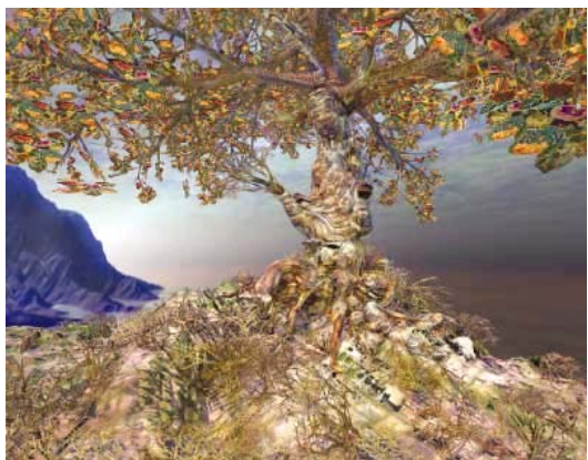
Minister Hill This unique landscape contains numerous human and animal Poser figures that are integrated into the Bryce scene.